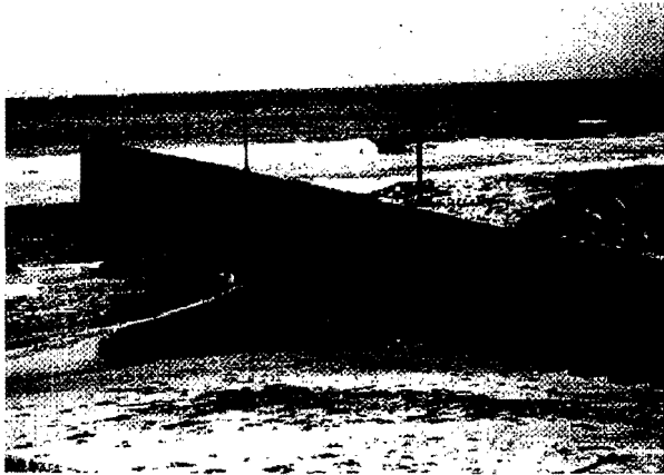
"Sheetpile" Steel Groin in West Newport 1970